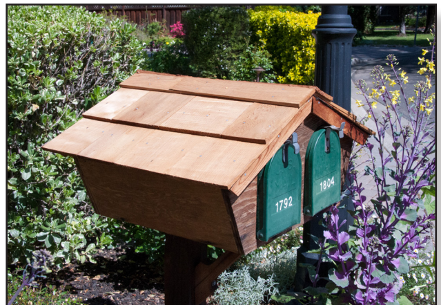
Example of reroofed mailbox

Our hired handyman has completed the reroofing of all of the FGE mailboxes and they look GREAT. We want to encourage homeowners to consider painting or staining their mailbox to complement their home colors.